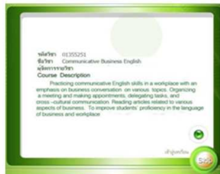
Appendix 1: Course Description